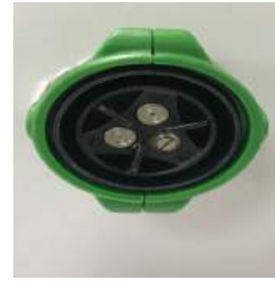
Nozzle #2 (Clean)