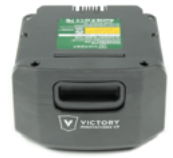
16.8 V Battery