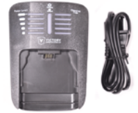
16.8 V Charger