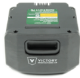
16.8 V Battery