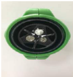
Nozzle #1 (Dirty)

Example below: Nozzle #1 (Dirty) & Nozzle #2 (Clean). Nozzle #1 has not been properly cleaned after being used. When not properly cleaned, residual chemical deposits build up on the sprayer nozzle. Deposit build-up results in decreased bar pressure and decreased spray patterns. The recommendation is that a full tank of water is sprayed through the unit after every few days of use to rinse any residual chemical build-up to reduce the chance of blockage.