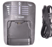
16.8 V Charger